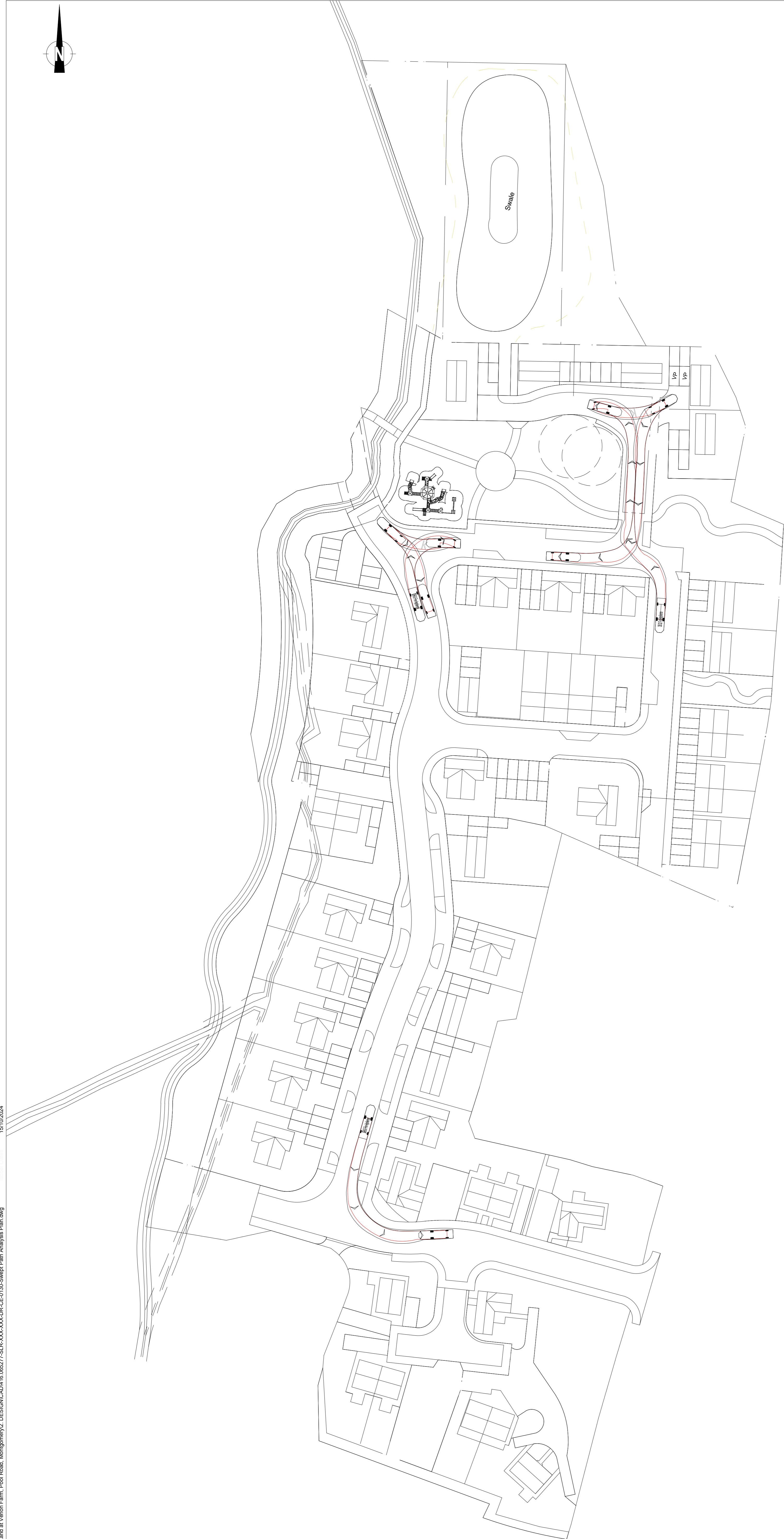
DB32 Fire Appliance