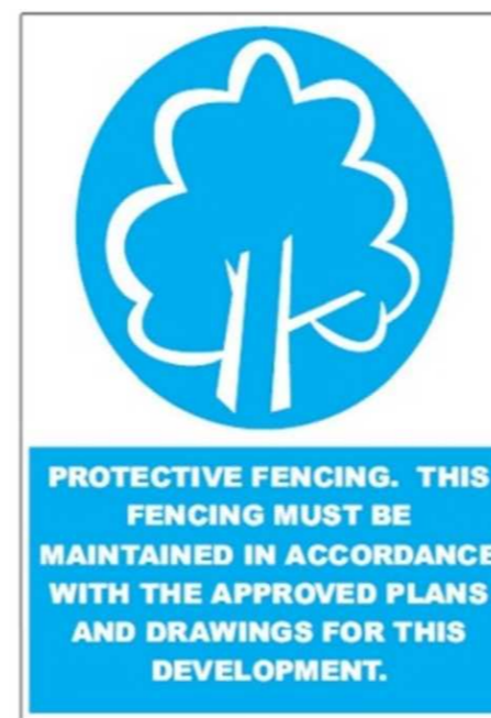
DETAIL 1 Tree Protection Signs